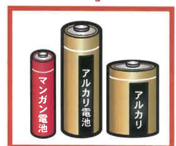
Battery (only Alkaline and manganese)