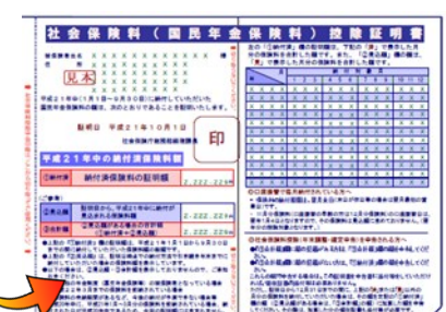
Inside the post card

will be mailed to you from the Japan Pension Service during the following months: