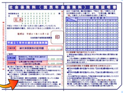
Inside the post card

will be mailed to you from the Japan Pension Service during the following months: